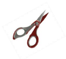
Knife or Scissors